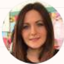
Wednesday for Tuesday