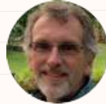
Wednesday for Wednesday